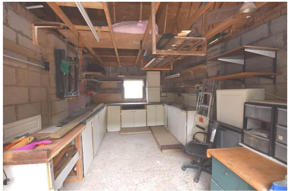
Next Home - Arisaig, Mount Pleasant, Newburgh, Cupar, KY14 6AD