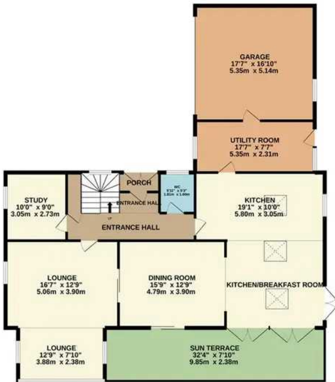
GROUND FLOOR 1597 sq.ft. (148.3 sq.m.) approx.