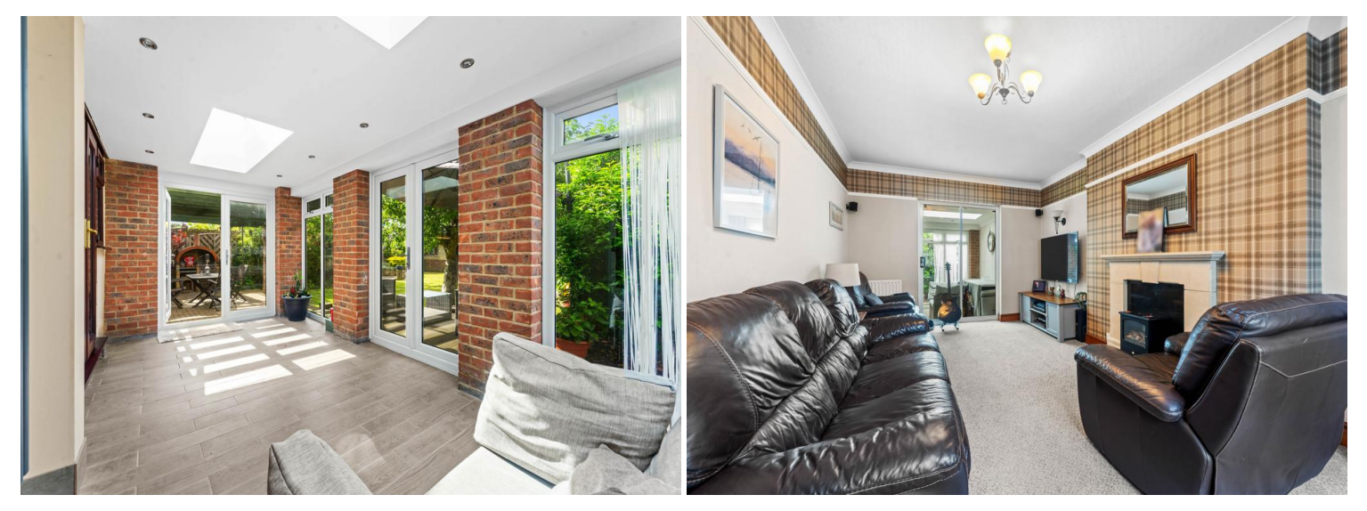
IMP ORTANT NOTE: Paul Graham have not tested any services, heating system, appliances, fixtures or fittings. References to the tenure of a property are based on information supplied by the seller as Paul Graham have not had sight of the title documents. Neither has Paul Graham checked any existing or necessary planning consents, building regulations or rights of way. Prospective purchasers are advised to obtain verification from their solicitor or surveyor. PLEASE NOTE: All measurements are approximate and represent the maximum dimensions of any room (into bays and alcoves) and a margin of error should be allowed.

ENTRANC E PORC H ENTRANC E HALL LOUNG E 18' 6" x 10' 11" (5.64m x 3.33m) KITCHEN 13' 5" x 9' 1" (4.09m x 2.77m) DINING ROOM 19' 4" x 9' 4" (5.89m x 2.84m) WC STAIRS TO THE FIRST FLOOR LANDING BEDROOM 1 11' 5" x 10' 8" (3.48m x 3.25m) BEDROOM 2 10' 11" x 6' 8" (3.33m x 2.03m) BEDROOM 3 8' x 6' 1" (2.44m x 1.85m) BATHROOM GARAGE 19' 3" x 18' 9" (5.87m x 5.72m) DRIV EWAY WITH OFF STREET PARKING LARGE GARDEN