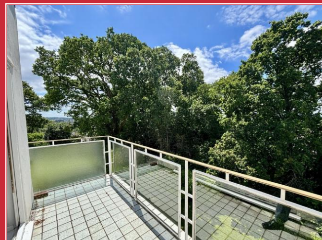
Flat 20 Harraby Green, Wallace Road, Broadstone BH18 8NG

A bright and airy, two double bedroom second floor apartment with two balconies enjoying far reaching views over Broadstone to Poole and the Purbecks.