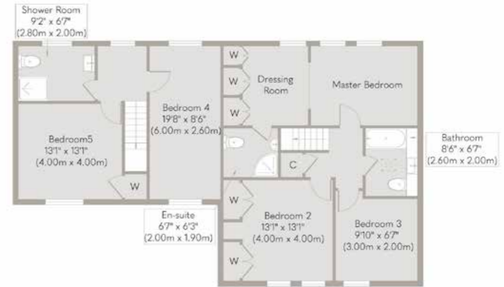
First Floor Approximate Floor Area 1,109 sq. ft (103.06 sq. m)