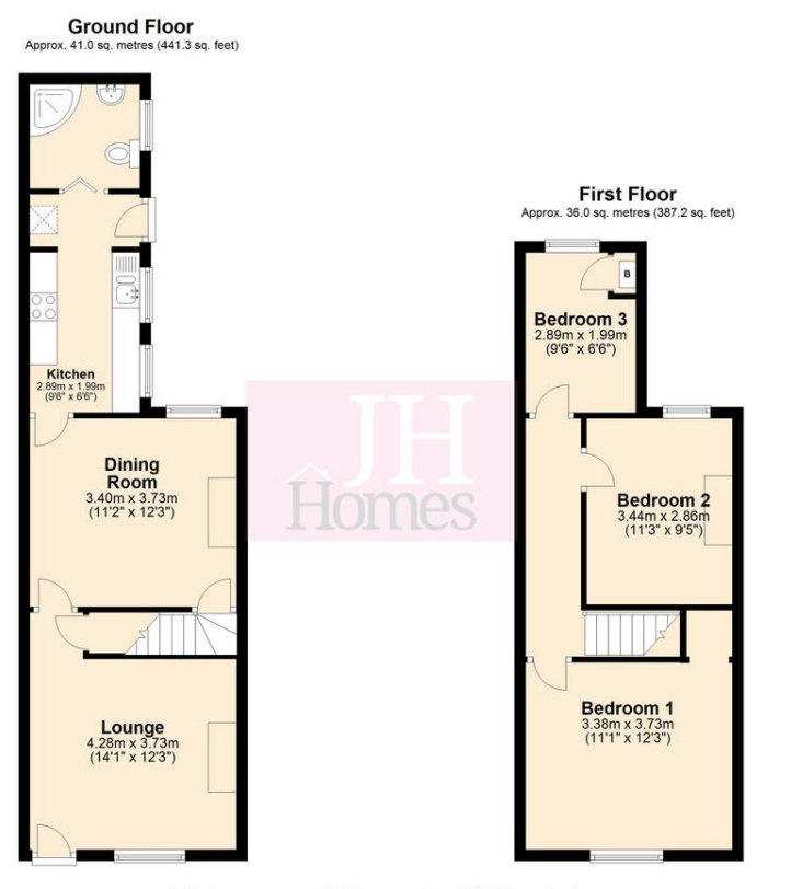
Total area: approx. 77.0 sq. metres (828.5 sq. feet)