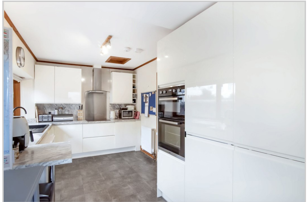
These particulars are believed to be correct, but their accuracy is not guaranteed and they do not form part of any contract. All measurements are approximate only.