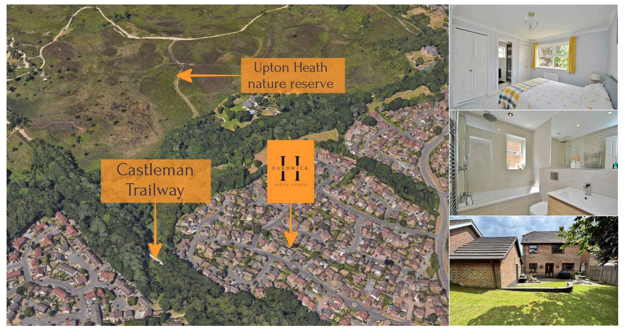
Hardwick Estate Agents would like to point out that all measurements and indications of plot size set out in these particulars are approximate and are for guidance only. We have not tested any apparatus, equipment, systems or services etc and cannot confirm that they are in working order or fit for purpose. No assumption should be made as to compliance with planning consents or current usage. Nothing in these particulars is intended to indicate that any carpets or curtains, furnishings or fittings, electrical goods (whether wired or not), gas fires or light fitments, or any other fixtures not expressly included form any part of the property being offered for sale. Whilst we endeavour to make our sales particulars accurate and reliable, if there is any point which is of particular importance to you, please contact us and we will be happy to confirm the position to you.