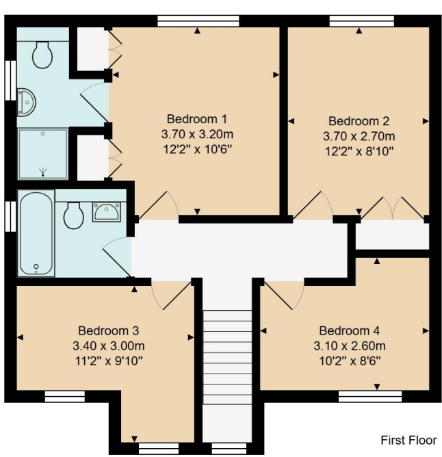
All measurements are approximate and for display purposes only.