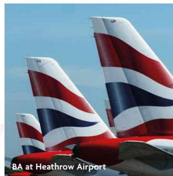
BA at Heathrow Airport

THE AIRPORT SUPPORTS 76,000 JOBS GENERATED BY OVER 400 COMPANIES