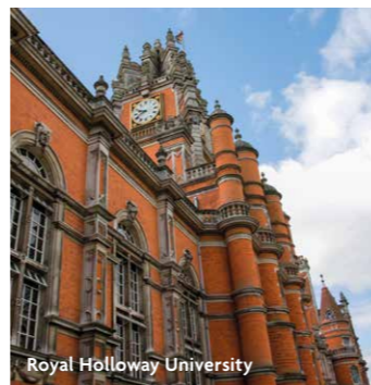
Royal Holloway University

Founded in 1886 and ranked one of the UK's top 20 universities, Royal Holloway is only 3.1 miles away from Eden Grove.