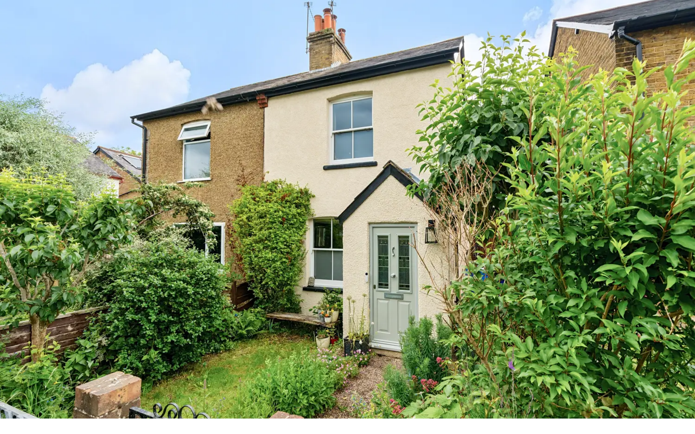
36 Bramble Walk, Epsom