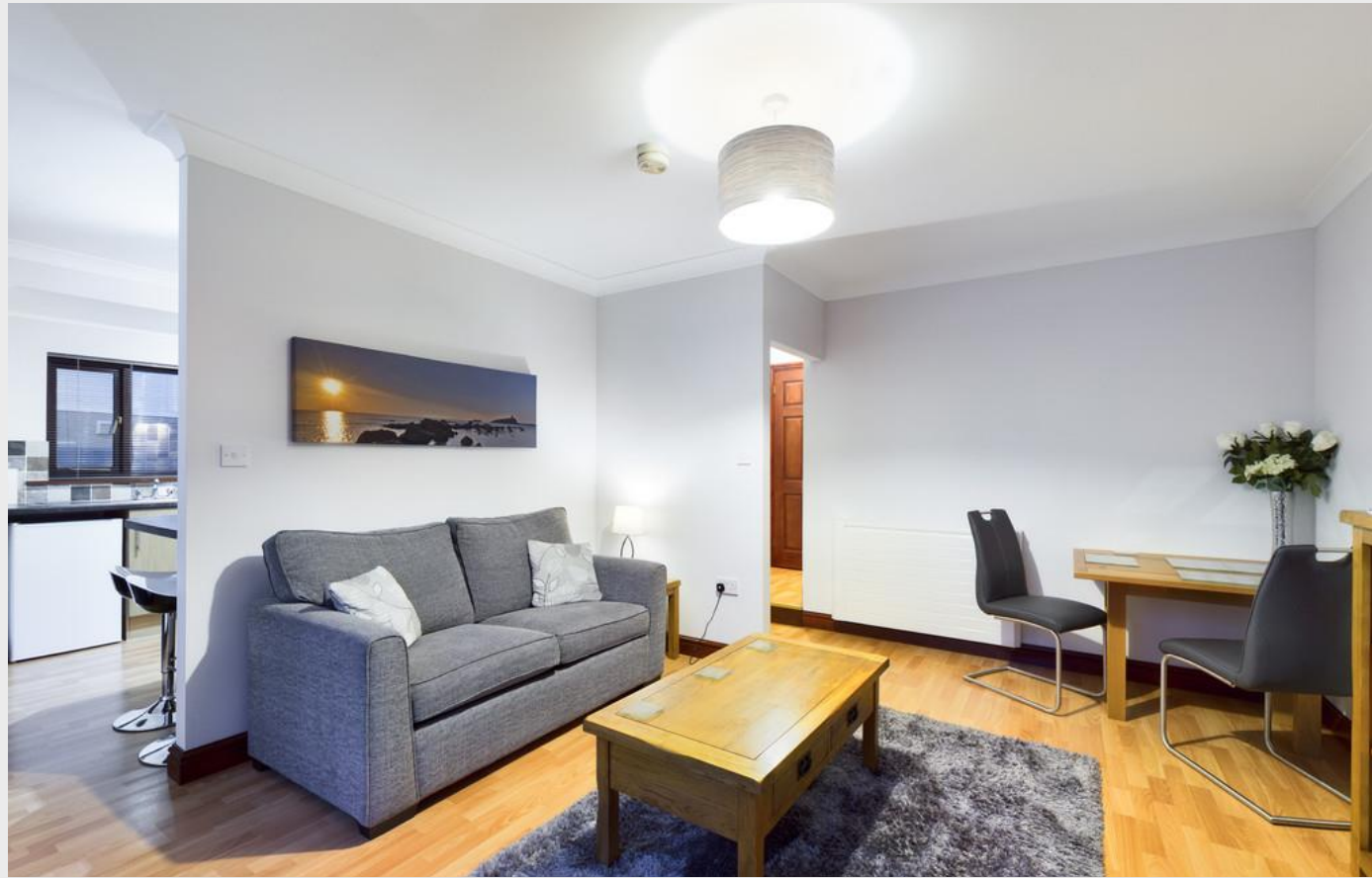
Priory Studio Living/Dining Room