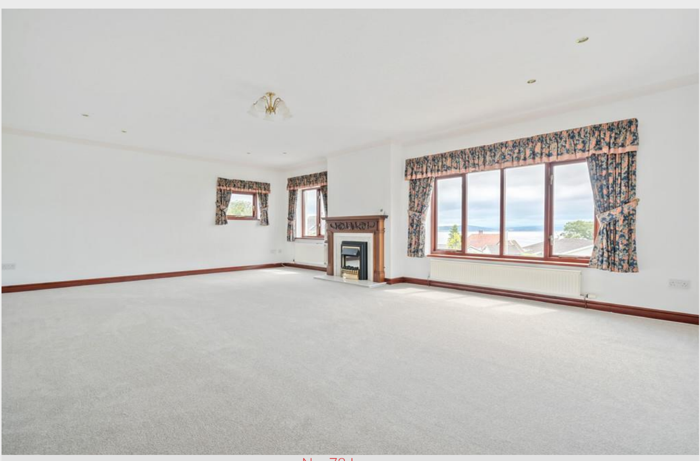
No. 73 Lounge

Bedroom 1 is of incredible dimensions with the most wonderful, far reaching Bay views through 3 front facing windows. In addition there are also 2 'Velux' roof windows. Extensive eaves storage. Bedroom 2 is of similar, indulgent proportions with a range of white fitted bedroom furniture. There is a walk in 'room' with reduced head height which would make an excellent walk in wardrobe perhaps and extensive eaves storage.