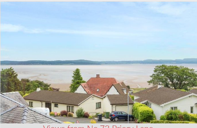
Views from No.73 Priory Lane