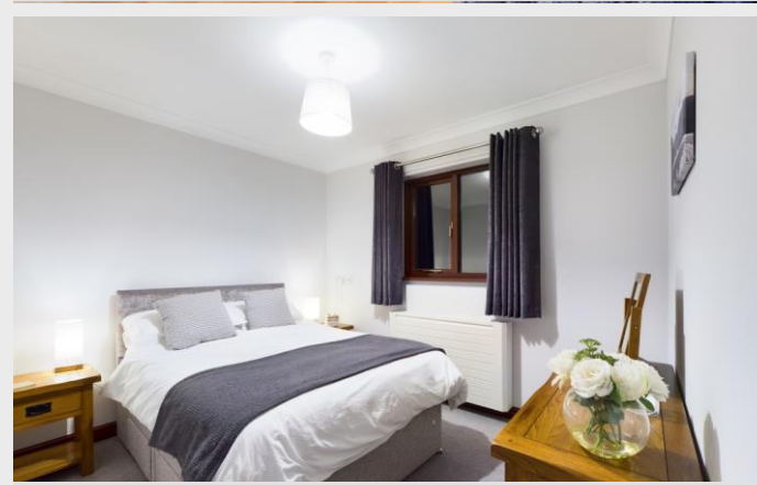
Priory Studio Bedroom