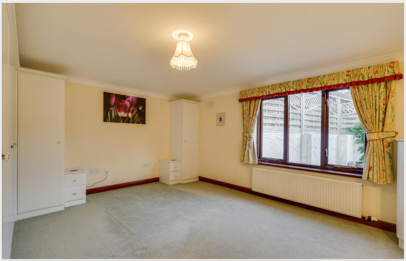
No.75 Bedroom 1

Hobbies Room/Store 1 11' 5" x 11' 5" (3.48m x 3.48m) with