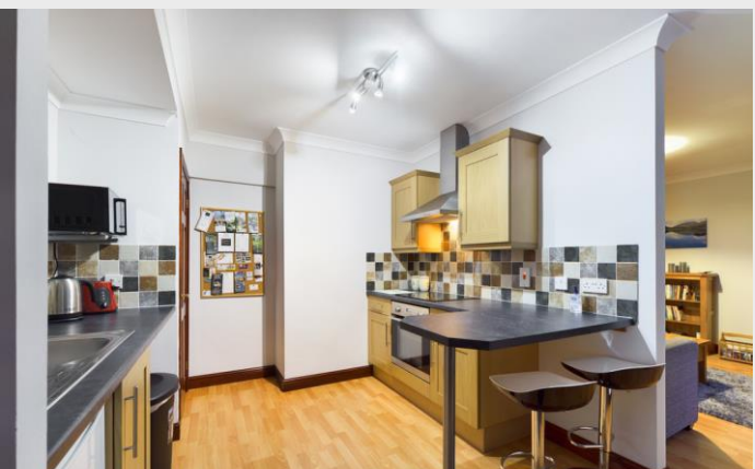
Priory Studio Kitchen