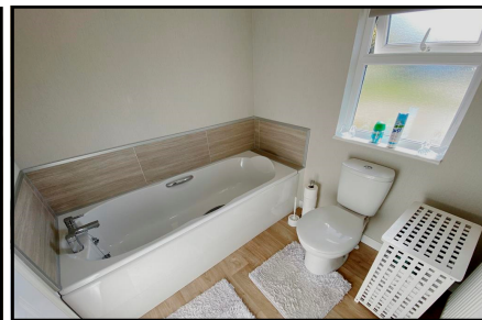
Pitch Fee: approx 314.78 per month including sewerage Subject to Annual Review Council Tax Band: 'B' Tenure: 1983 Mobile Homes Act Agreement