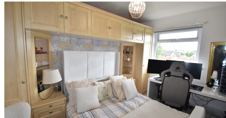
13 Leishman Court