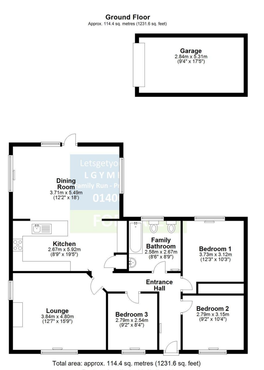
Floor plans are for a guide only and should not be scaled. Plan produced using PlanUp.