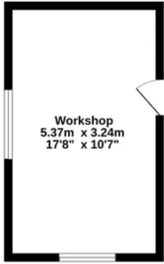
Workshop 17.4 sq.m. (187 sq.ft.) approx.