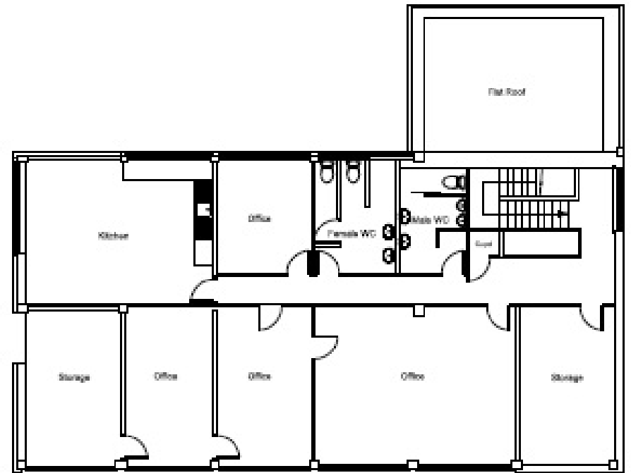
FIRST FLOOR (EXISTING)