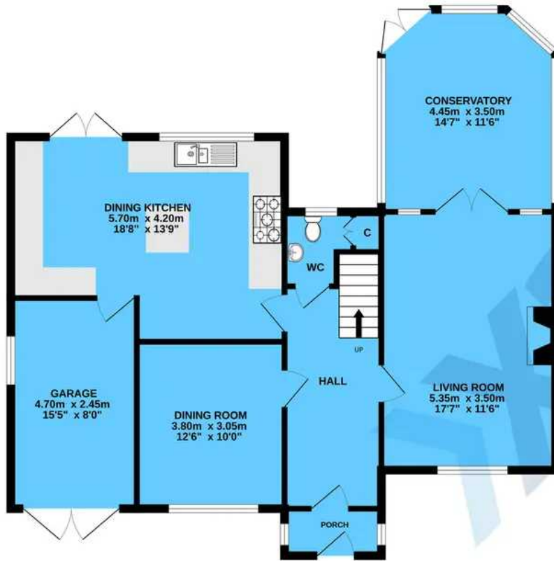
GROUND FLOOR 94.8 sq.m. (1020 sq.ft.) approx.