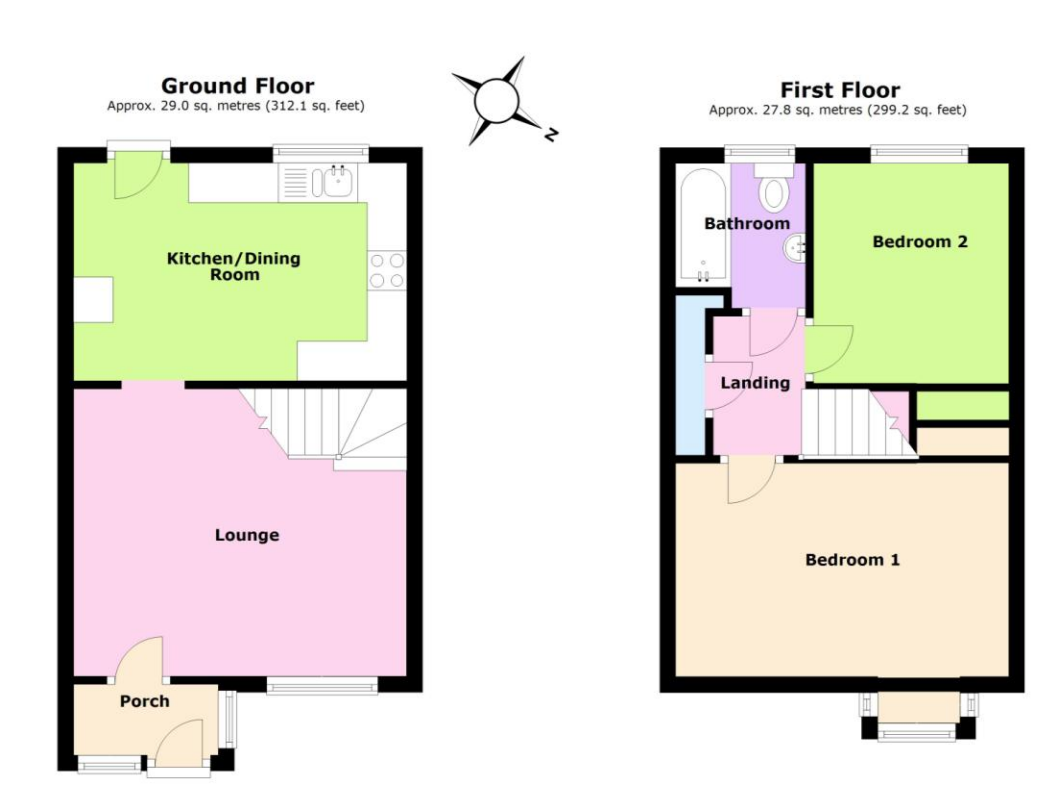
Total area: approx. 56.8 sq. metres (611.3 sq. feet)