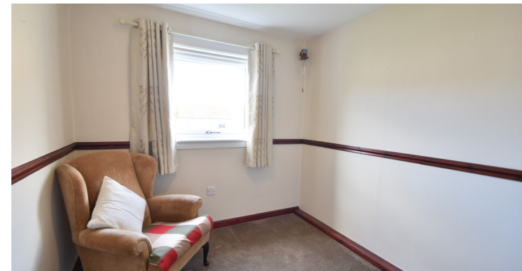
27 Gill Park