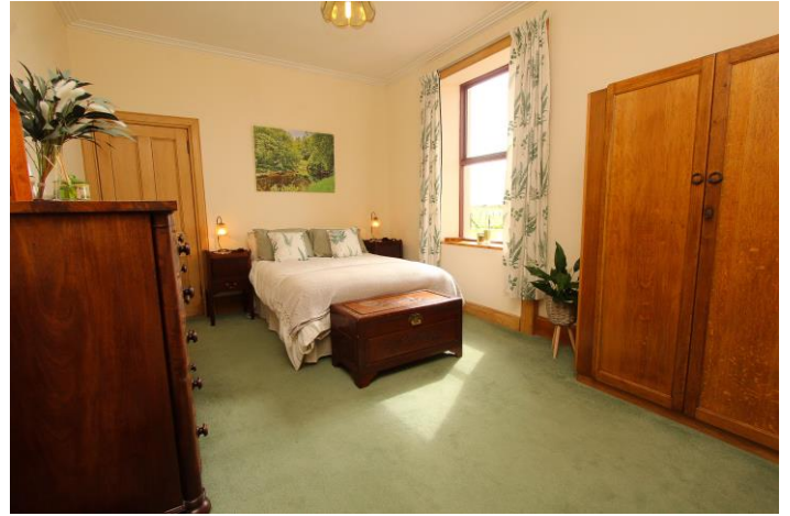
BEDROOM 1: A ground floor bedroom with CH radiator.