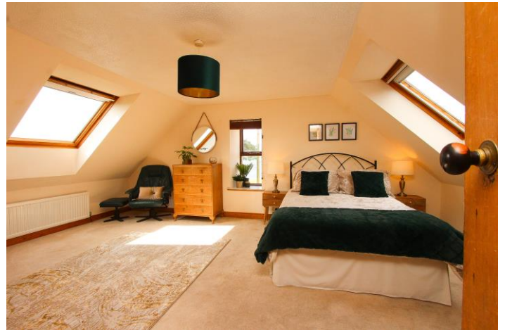
BEDROOM 2: A triple aspect bedroom with views to Loch Ryan. CH radiators.