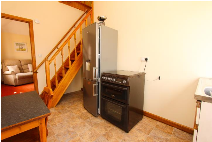
UTILITY ROOM: Fitted with floor unit with a stainless-steel sink. Access to the garden.