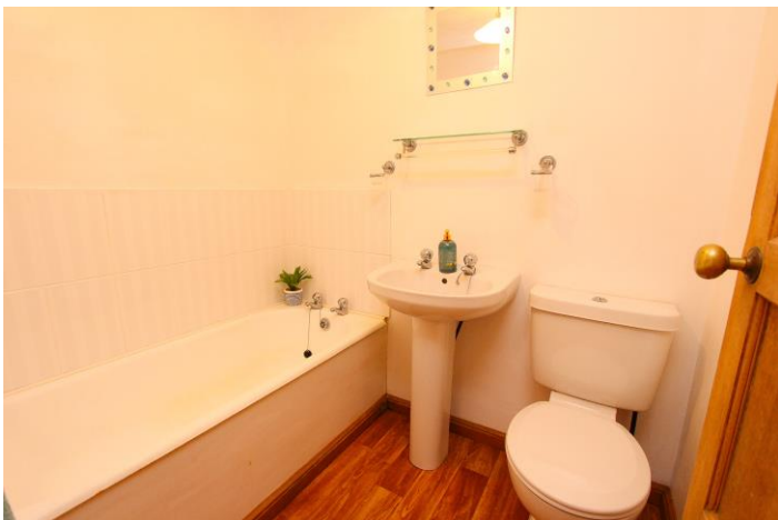
BATHROOM: A further ground floor bathroom fitted with a three-piece suite in white comprising a WHB, WC and bath.