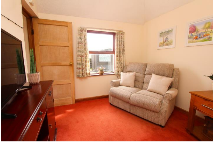
SNUG: A reception room to the rear with TV point.