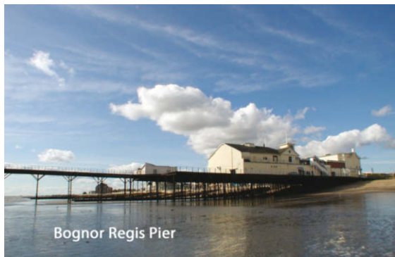
Bognor Regis Pier

To arrange a viewing call 01243 842123 View details online at henryadams.co.uk