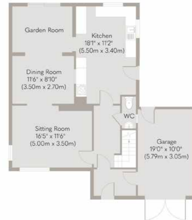
Ground Floor Approximate Floor Area 946 sq. ft (87.84 sq. m)

Whilst every attempt has been made to ensure the accuracy of the floor plan contained here, measurements of doors, windows, rooms and any other items are approximate and no responsibility is taken for any error, omission, or mis-statement. This plan is for illustrative purposes only and should be used as such by any prospective purchaser or tenant. The services, systems and appliances shown have not been tested and no guarantee as to their operability or efficiency can be given.