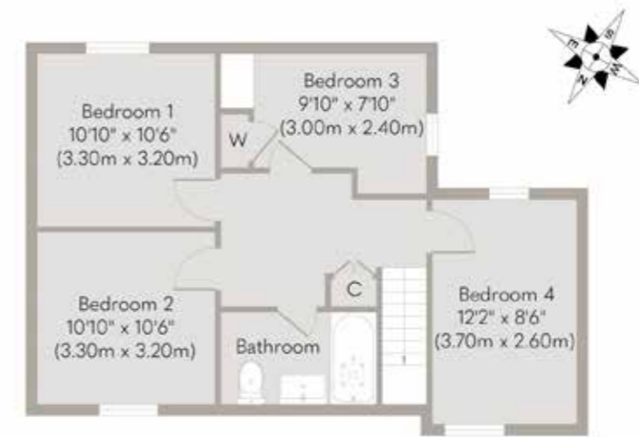
First Floor Approximate Floor Area 592 sq. ft (54.98 sq. m)