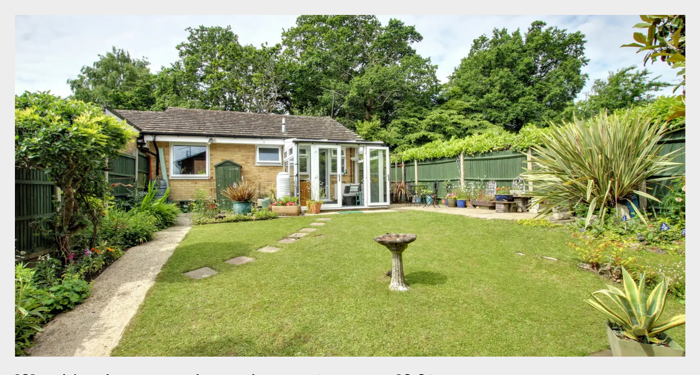
131 Hoblands, Haywards Heath, West Sussex RH16 3SB

GUIDE PRICE ... £350,000-£365,000 ... FREEHOLD