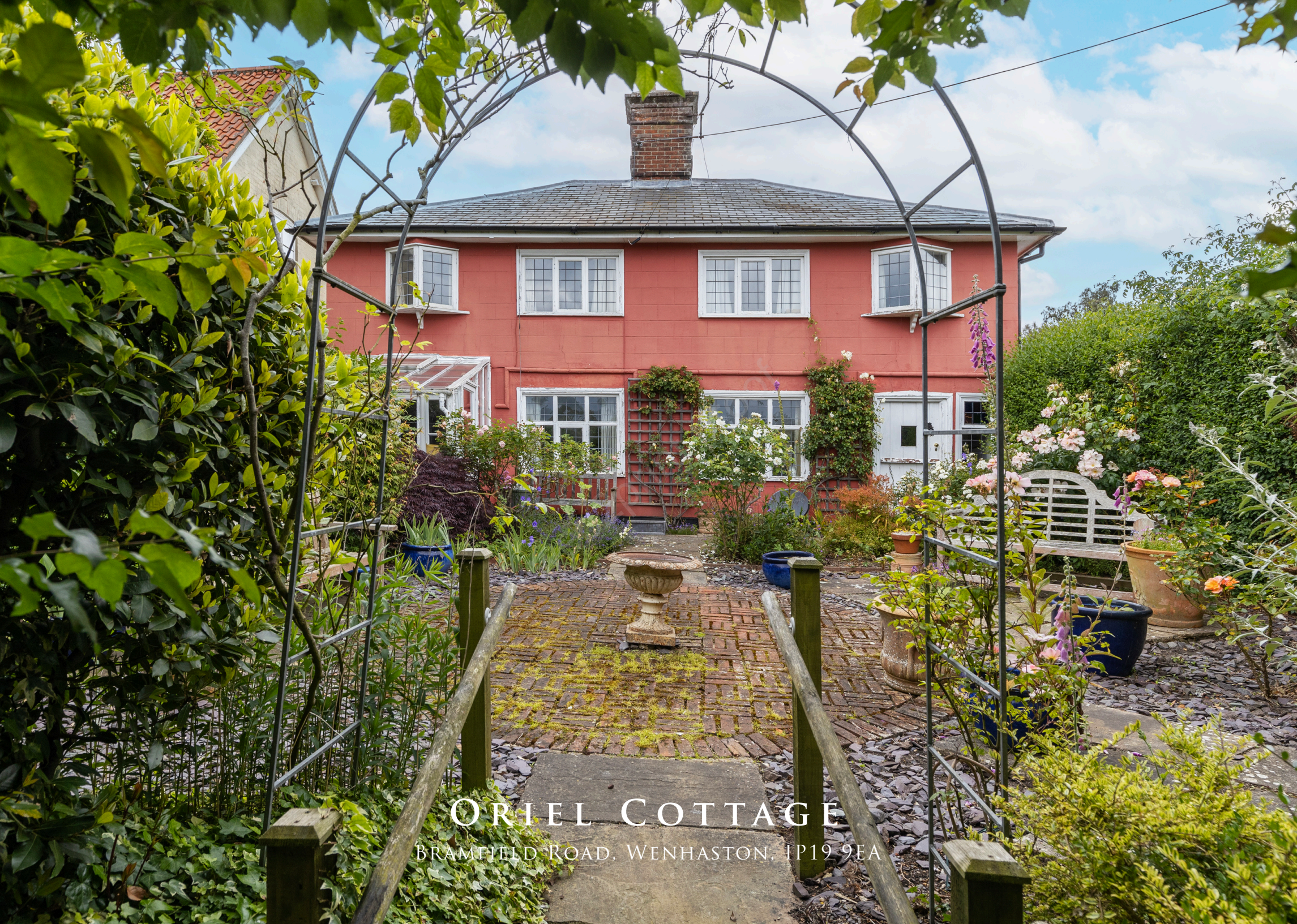
ORIEL COTTAGE BRAMFIELD ROAD, WENHASTON, IP19 9EA