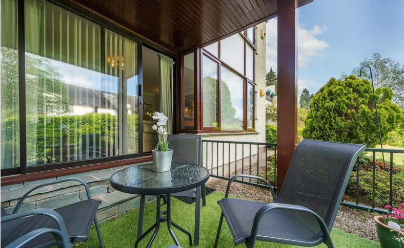
Covered Patio Seating Area