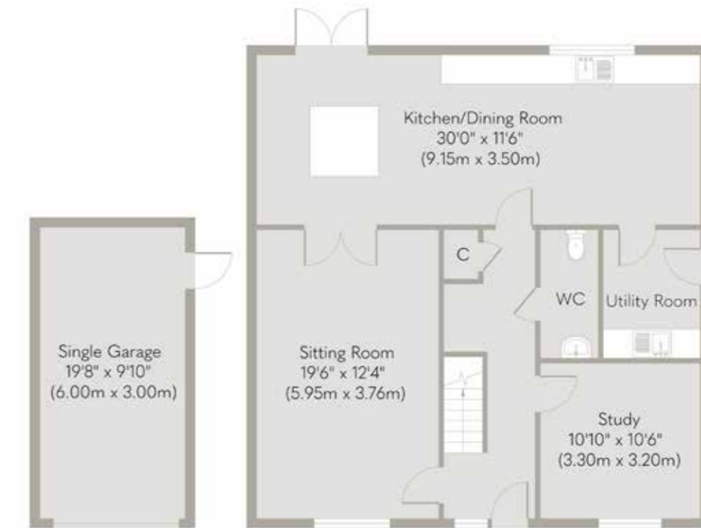
Garage Approximate Floor Area 194 sq. ft (18.00 sq. m)