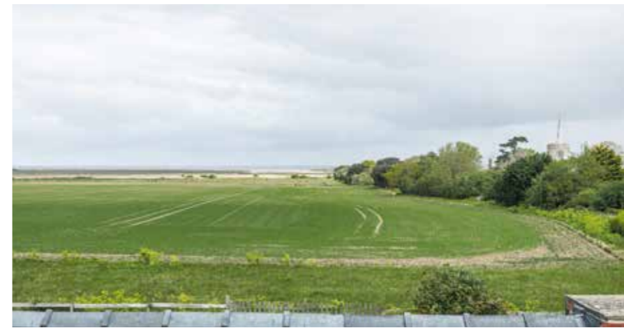
Looking over fields towards the coast, to the rear of 1 Main Road

"...here you look out across the RSPB nature reserve directly onto the coastline where the tide rolls in over pristine sand."