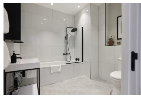
Royal Majestic Apartments, London NW2 £575,000 Share of Freehold

Welcome to The Royal Majestic - a collection of 16 stylish one, two and three bedroom properties, brought to you by Gage Properties