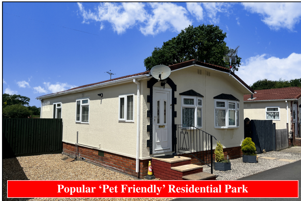
Popular 'Pet Friendly' Residential Park

46 The Square, Oaktree Park, St Leonards, Ringwood. BH24 2RL