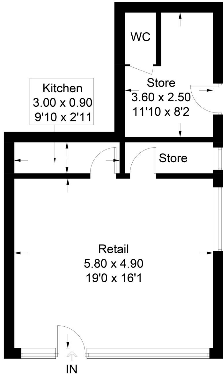
Illustration for identification purposes only, measurements are approximate, not to scale. (ID1092314)