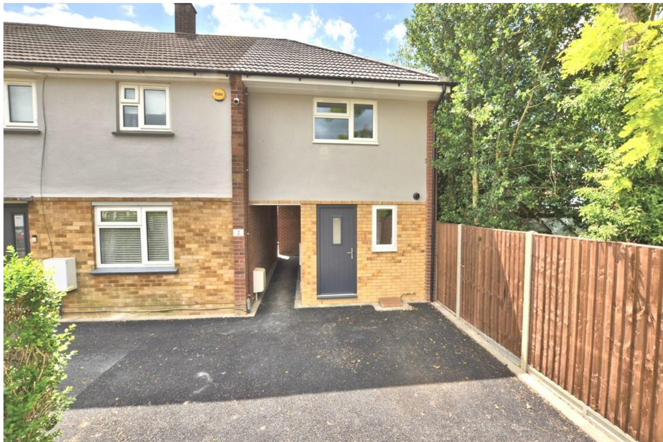
Jermyn Close, Cambridge