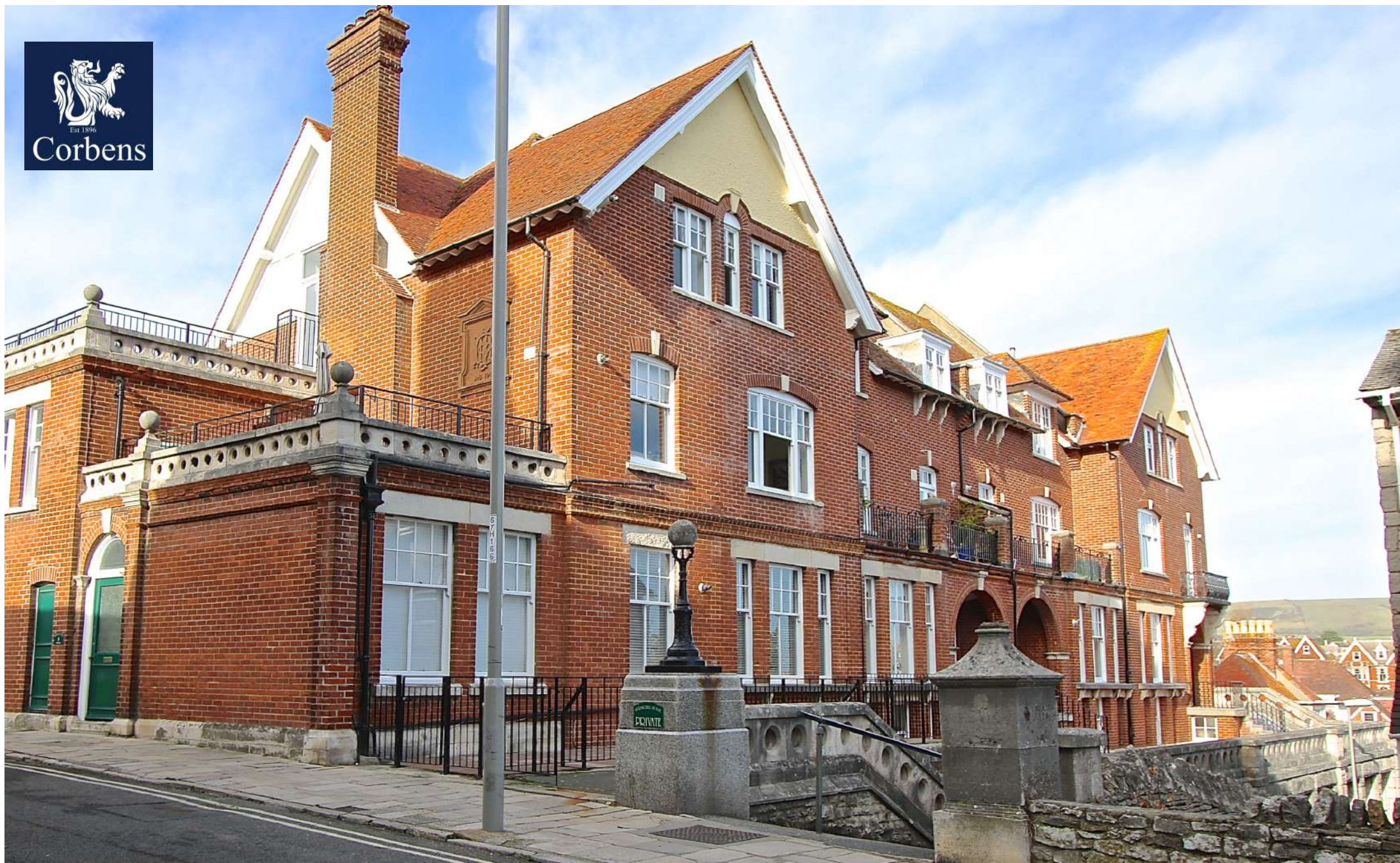
7 SPRINGHILL HOUSE, HIGH STREET, SWANAGE £345,000 Shared Freehold