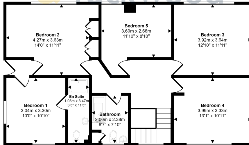
First Floor Approx 90 sq m / 967 sq ft

This floorplan is only for illustrative purposes and is not to scale. Measurements of rooms, doors, windows, and any items are approximate and no responsibility is taken for any error, omission or mis-statement. Icons of items such as bathroom suites are representations only and may not look like the real items. Made with Made Snappy 360.