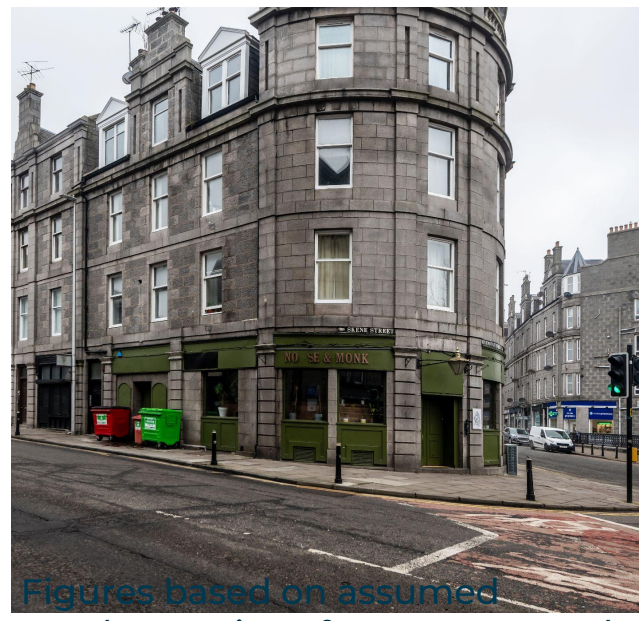
purchase price of £77,000.00 and borrowing of £57,750.00 at 75% Loan To Value (LTV) and an estimated 5% fixed term interest rate.