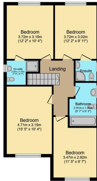
First Floor Floor area 69.8 sq.m. (751 sq.ft.)