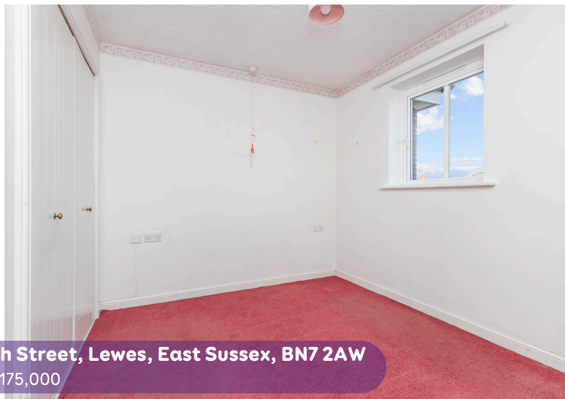
Flat 22, St. Thomas Court, Cliffe High Street, Lewes, East Sussex, BN7 2AW Price: £175,000