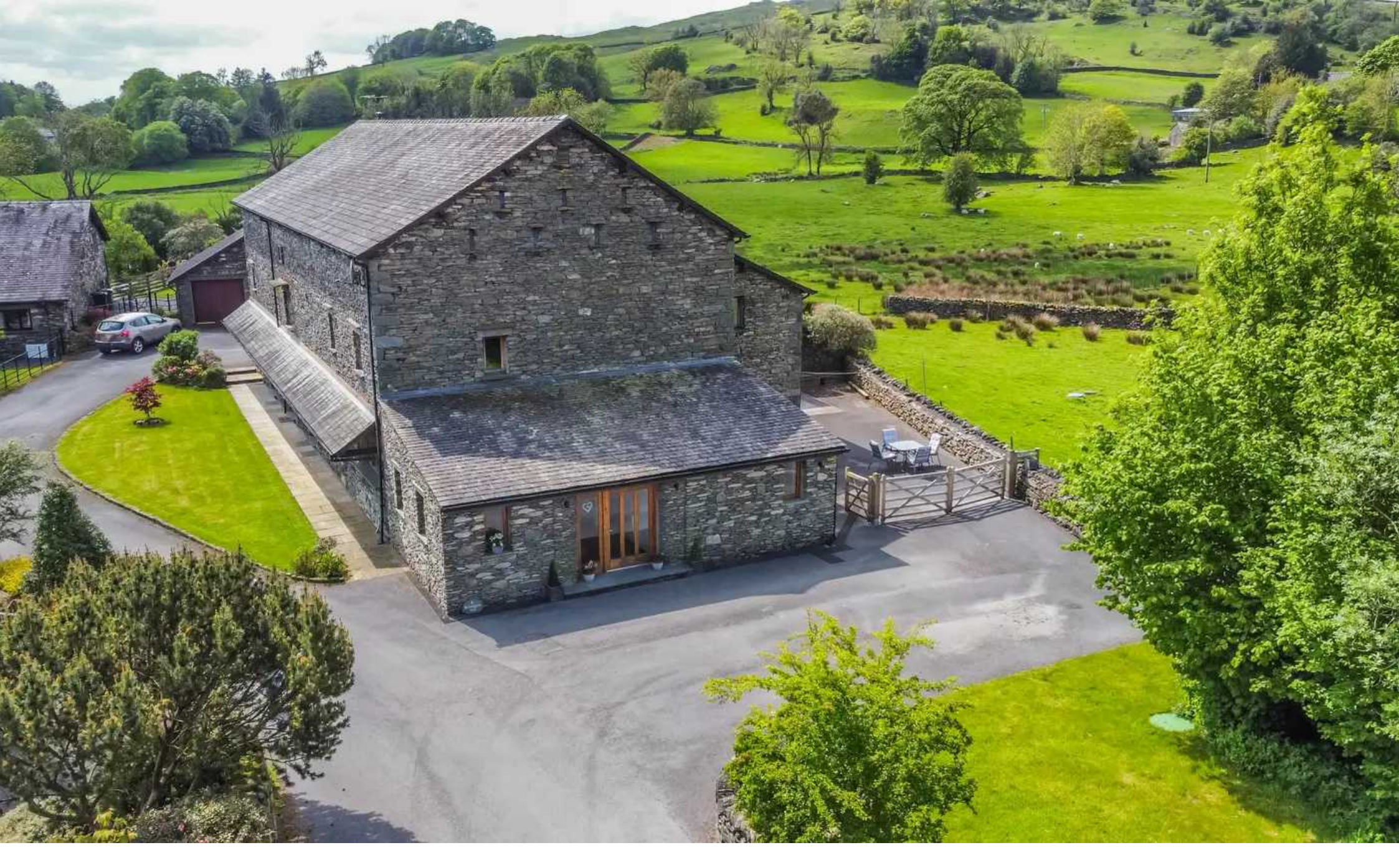
2 Broadgate Hall, Windermere £620,000