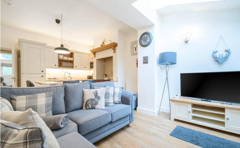
Open Plan Kitchen/Dining Area