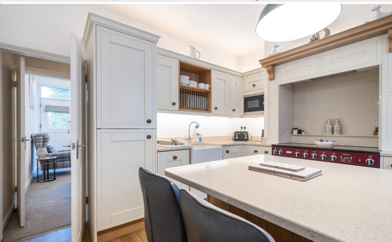
Open Plan Kitchen/Dining Area