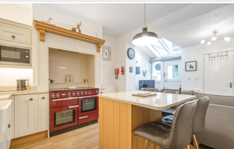
Open Plan Kitchen/Dining Area