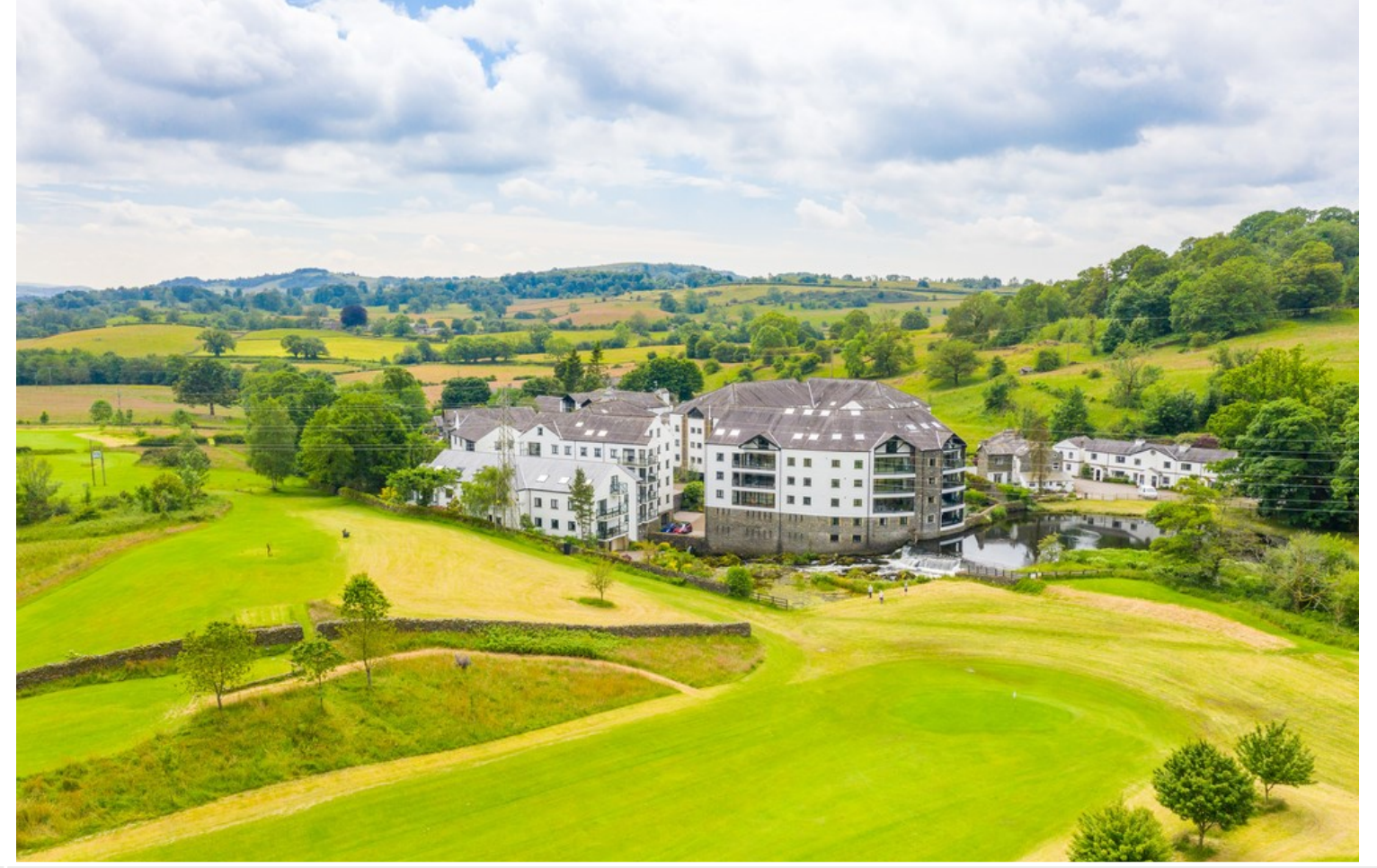
Golf Course & The Estate