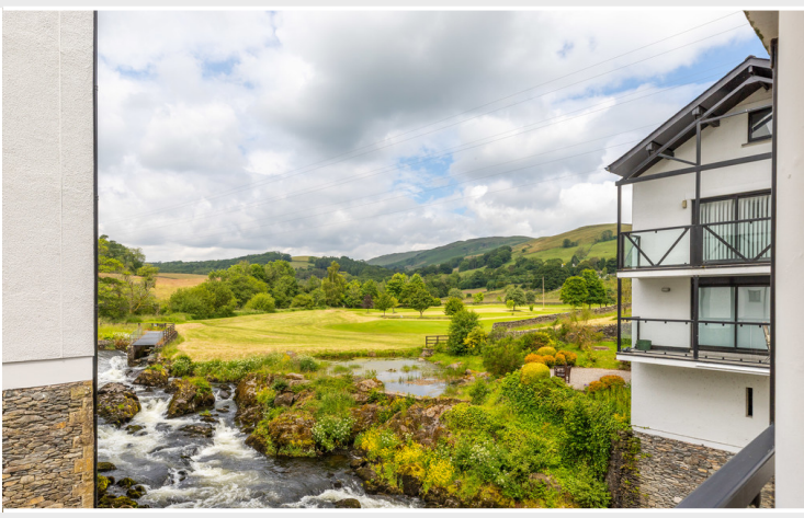
Views from the balcony