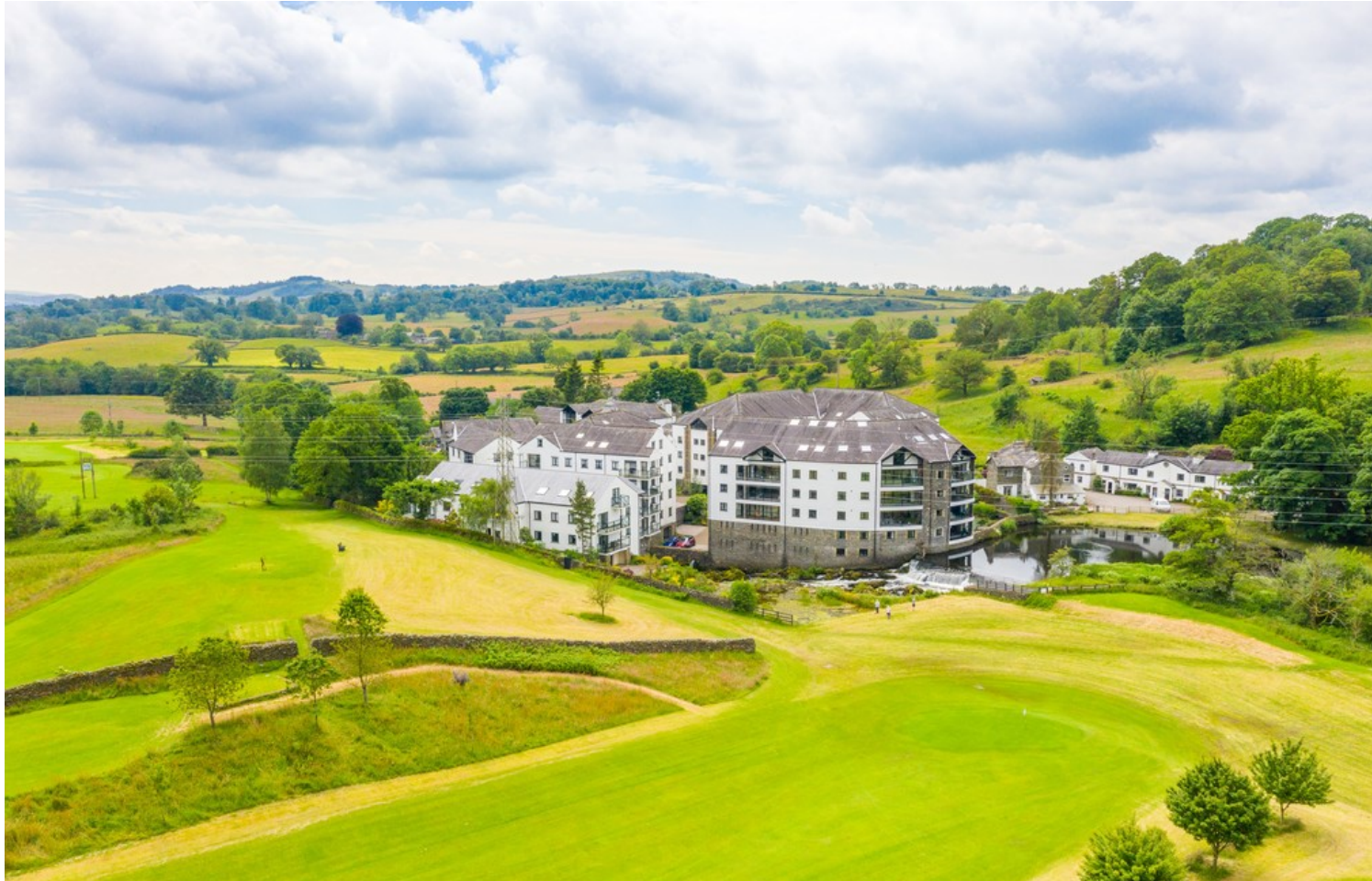
Golf Course & The Estate