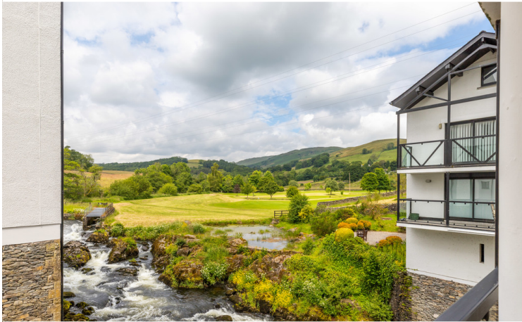
Views from the balcony