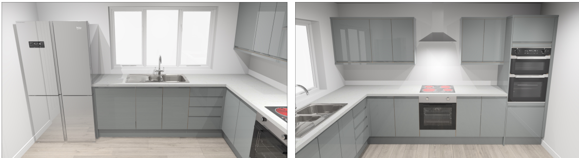
Proposed kitchen layout