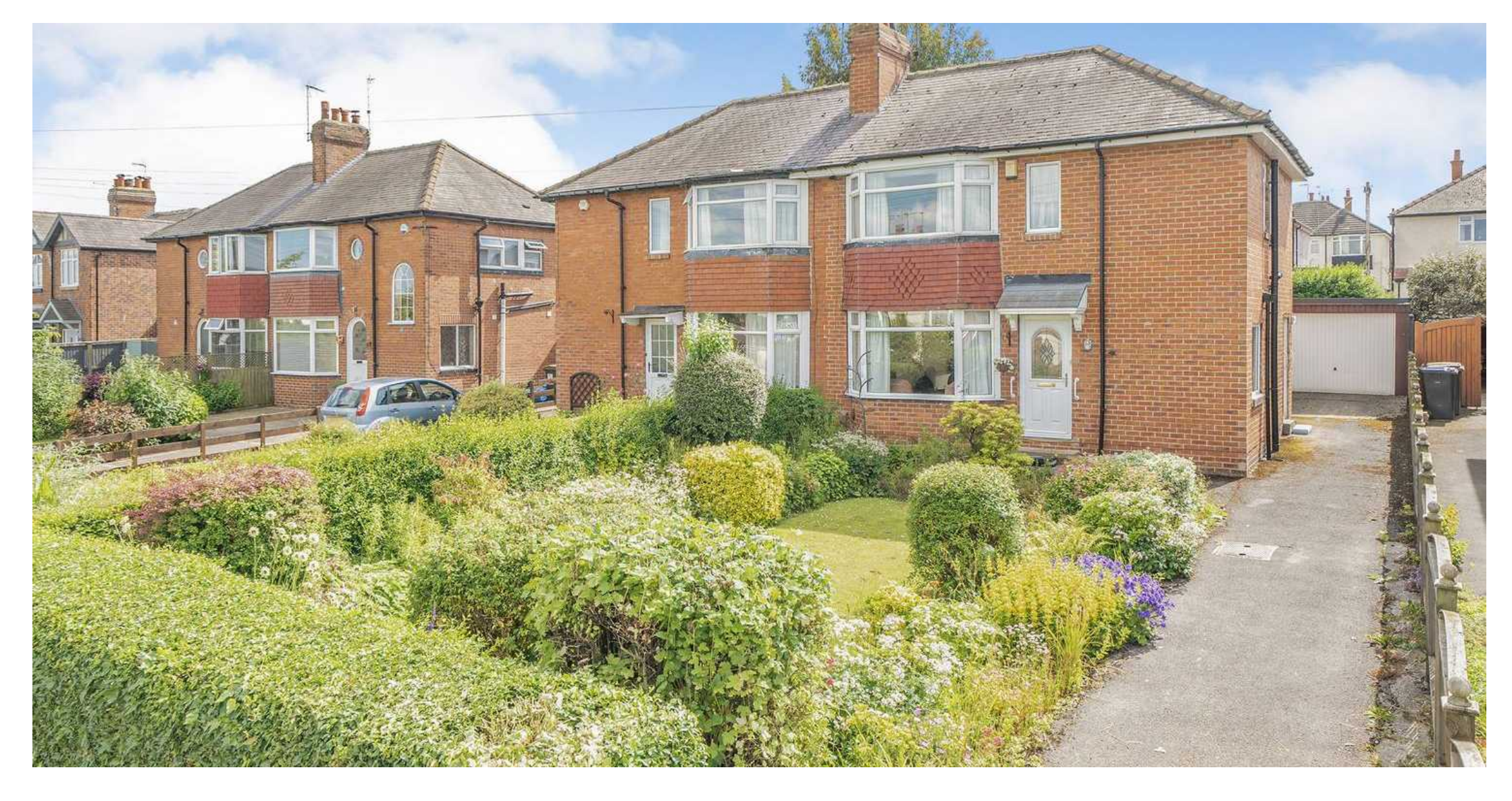
71 Kingsley Road, Harrogate