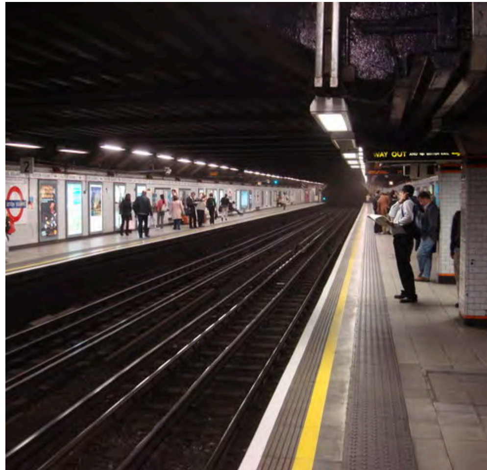
Euston Square Station