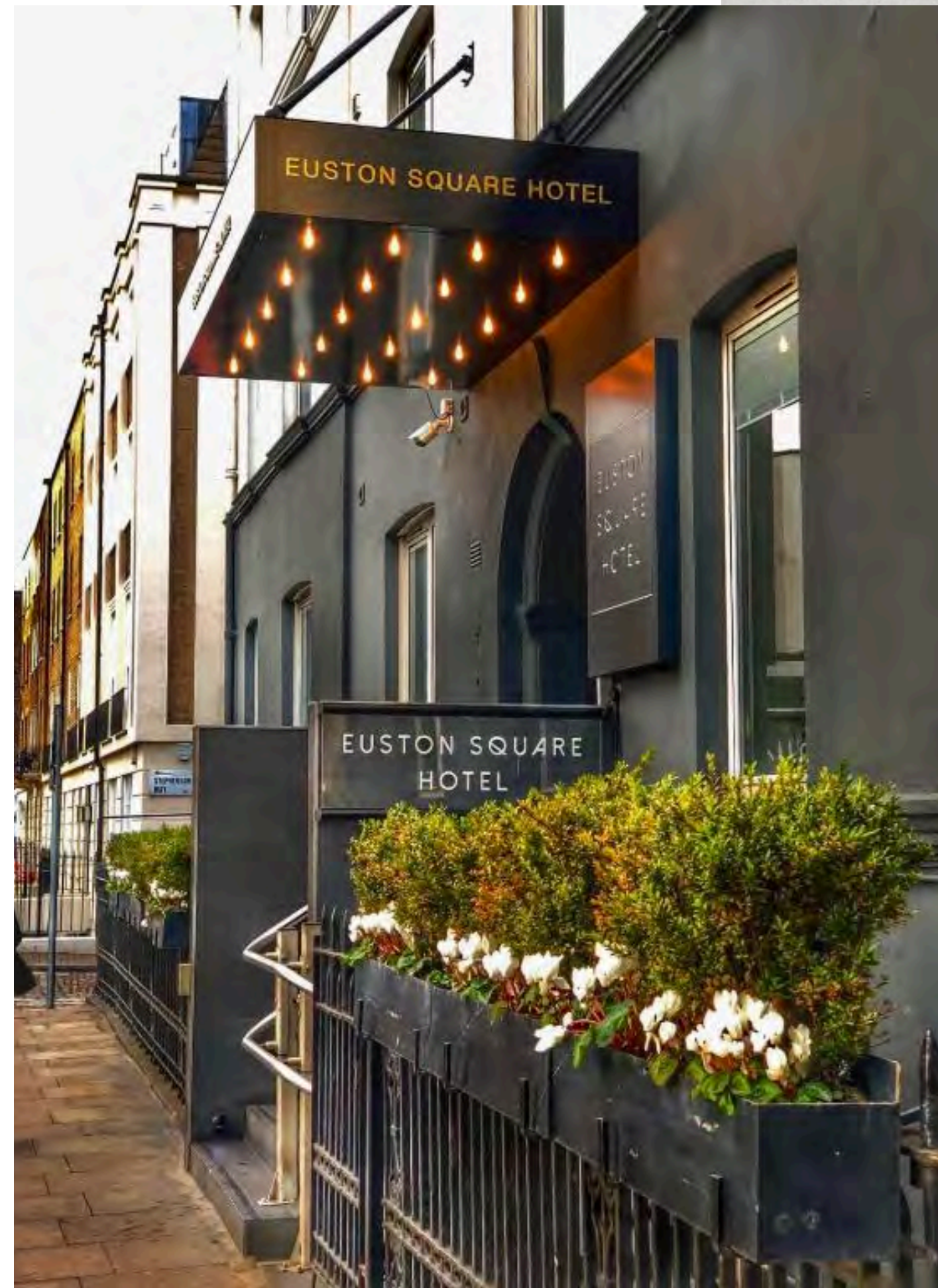
Euston Square Hotel