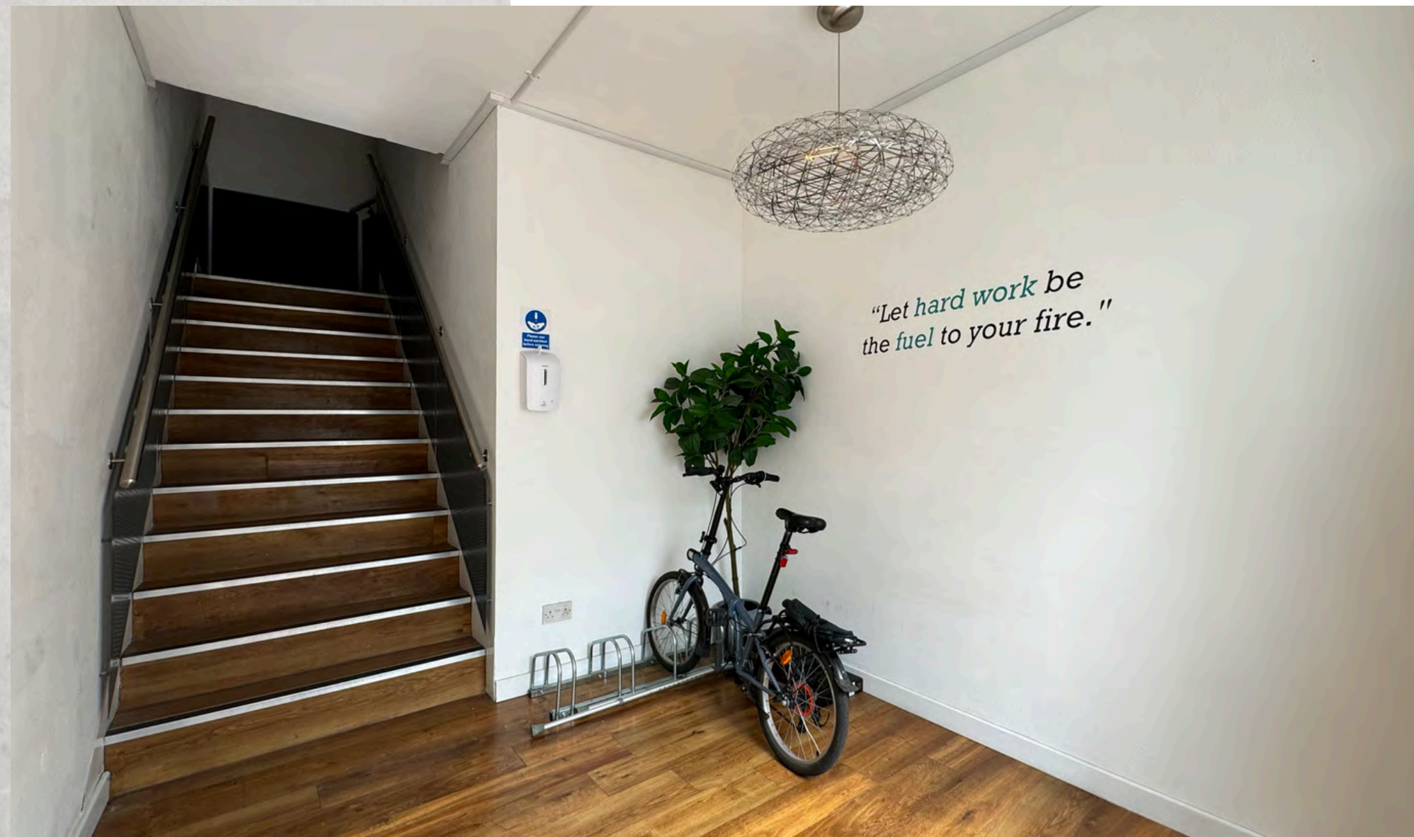
Ground Floor Reception