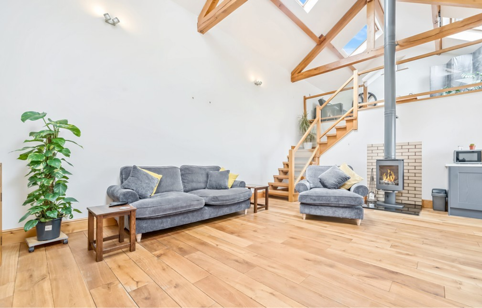
Annexe Living Room / Kitchen