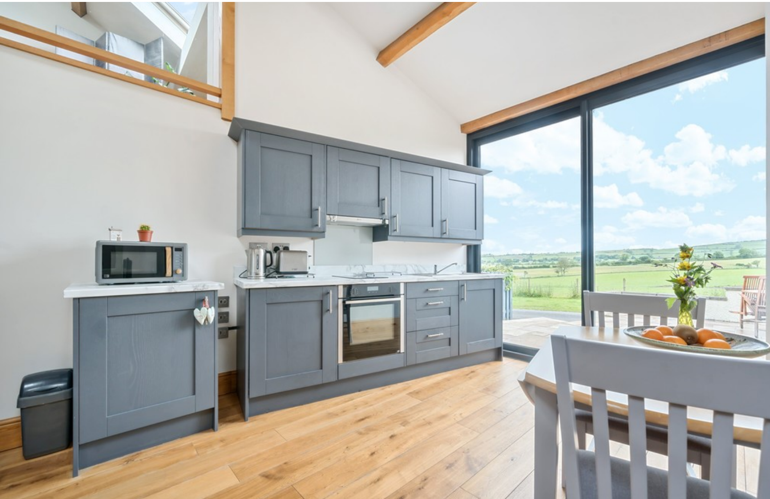
Annexe Living Room / Kitchen