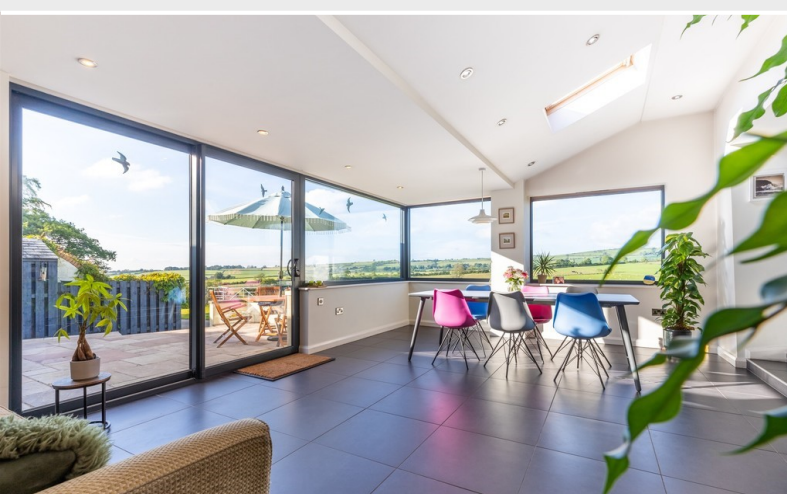
Sun Lounge / Dining Room