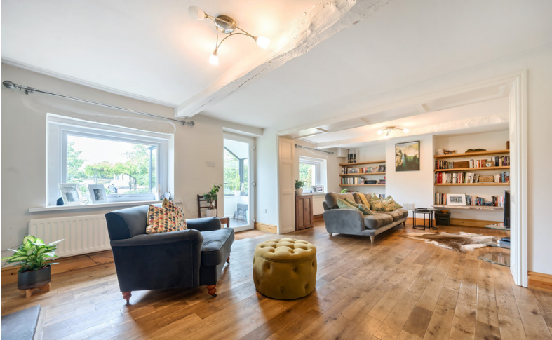
Living / Dining Room