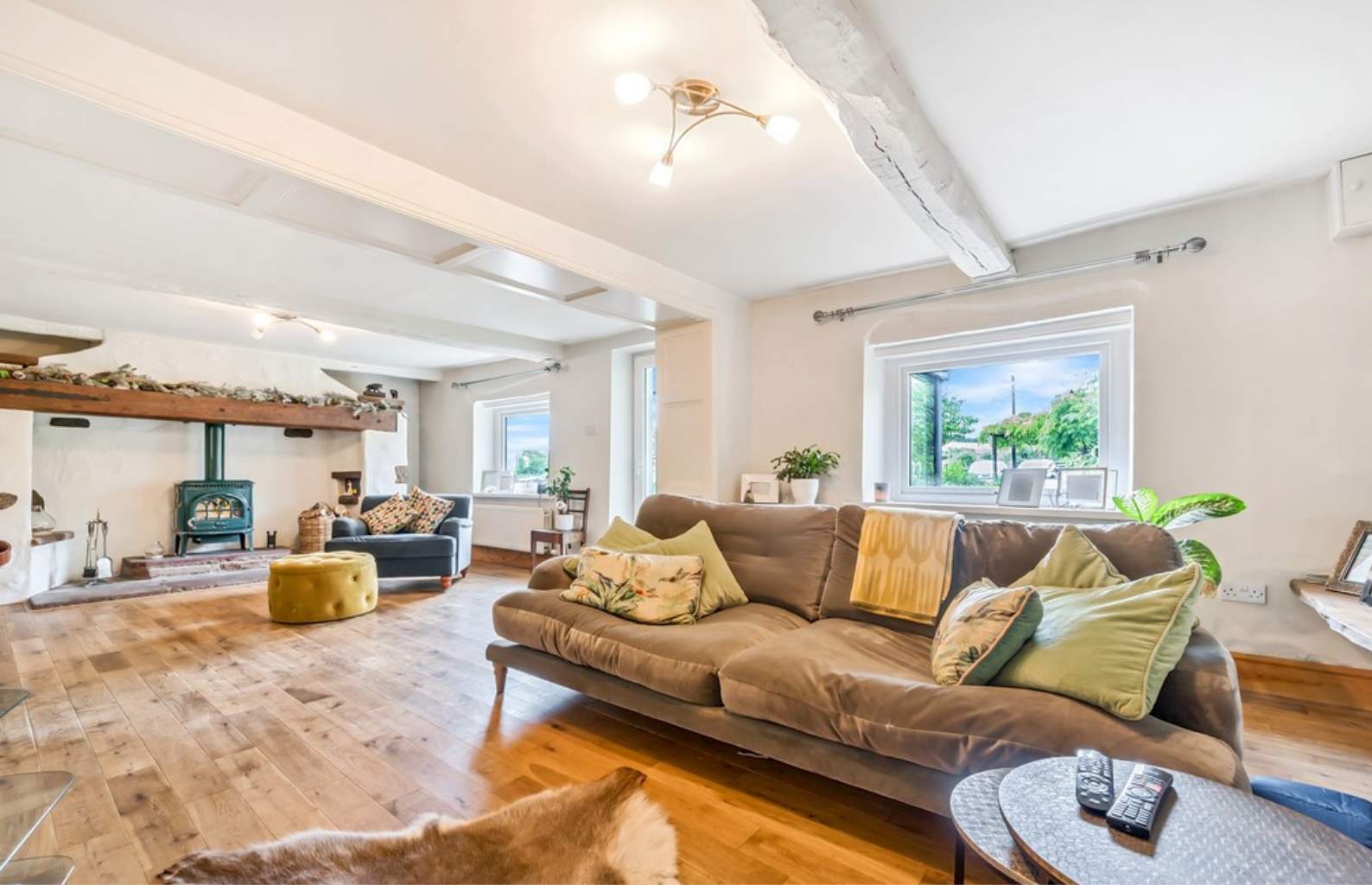
Living / Dining Room