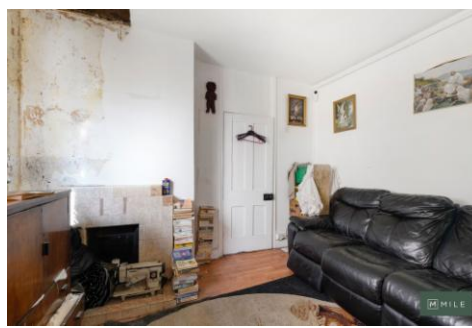
St. Johns Avenue, London NW10 £700,000 Freehold