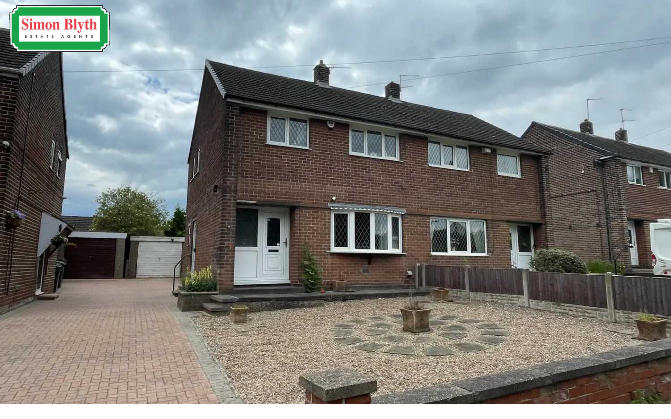
St. Francis Boulevard, Barnsley