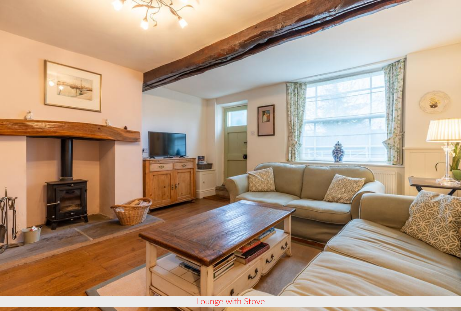
Lounge with Stove

Location: Enjoying a convenient position being tucked away from the main street and yet only a minute from the bustling centre of Kirkby Lonsdale,