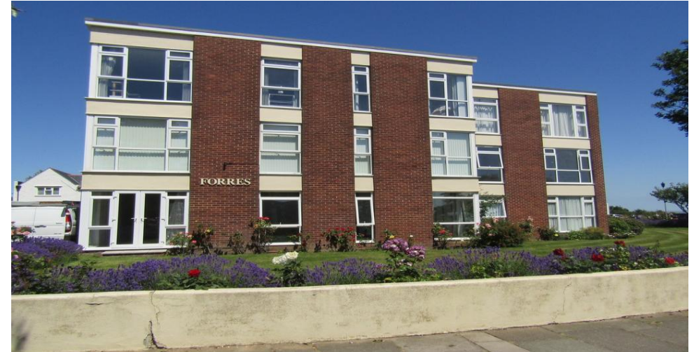
The Esplanade Frinton-on-Sea

Rent: £1,300 pcm Energy Efficiency Rating C