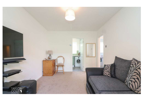
Church Lane Kingsbury, Tamworth, B78 2LR