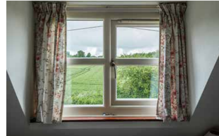
View from bedroom one.

“The beautiful views over the open farmland.”